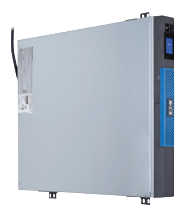
Wallmount: 5P 1500/1550 VA