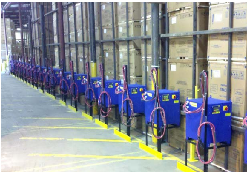
After: opportunity/fast charging stations

Reduction in lift trucks after ABT's final implementation.