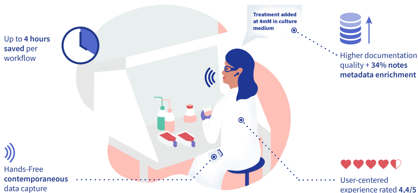
Fig.2: Digital lab assistants as a lab companion.

As a practical assistant for all types of lab work, LabTwin includes smart tools such as voice-activated timers, calculations, and error-preventing systems, which can be seamlessly incorporated within the workflow. With hands-free data capture and access in real time, LabTwin increases efficiency by saving time, reducing errors and ensuring overall data integrity.