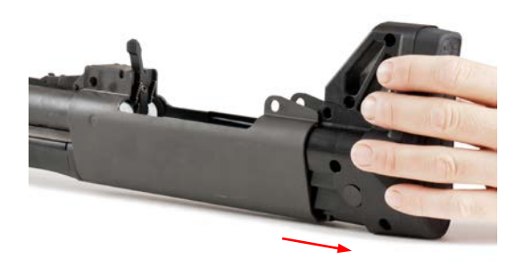
Figure D-4: Pull Stock Rearward

1. Grip the stock as shown in Figure D-4 and pull rearward to remove.