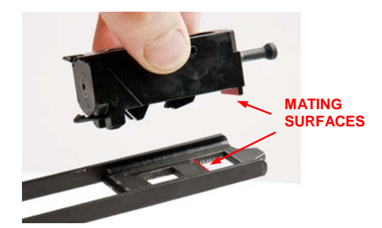
Figure E-6: Push Bolt Fully Forward on Bolt Carrier