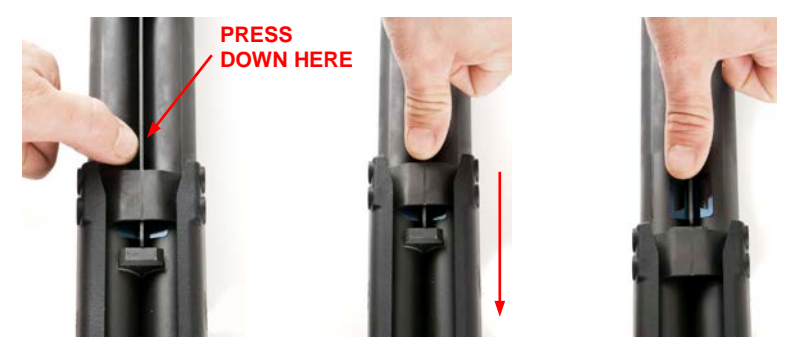
Figure D-7: Press down CTG Stop Actuator and Slide Forend Away

2. The KSG-334-CTG Stop Actuator must be pressed down for clearance as the barrel and receiver assemblies are separated, as shown in Figures D-7 & D-8 .