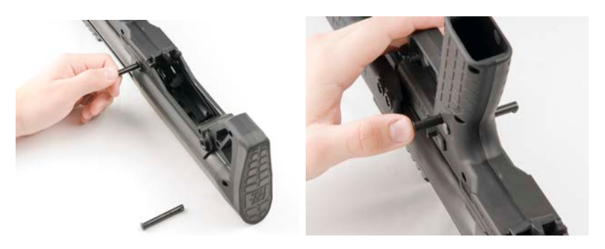
Figure D-2: Place Rear Assembly Pins in Retaining Holes

4. Remove the grip assembly by lifting the rear of the assembly directly upwards as shown in Figure D-3 .