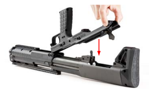
Figure E-8: Move Forend Rearward and Insert Grip Assembly