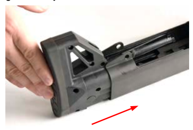
Figure E-7: Lift Firing Pin while Inserting Stock