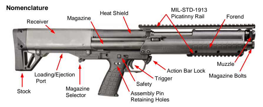
Figure B-1: Side-View

Two integral MIL-STD-1913 Picatinny rails, located above the barrel and on the forend, come standard with the KSG™ for mounting accessories. Unloaded, the KSG™ maintains a center of gravity over the grip assembly to facilitate ease of handling.