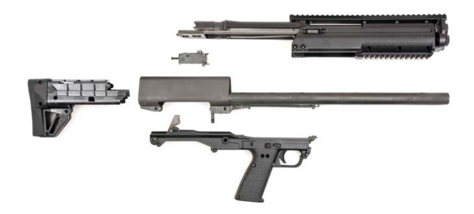
Figure D-1: KSG<sup>™</sup> General Disassembly

For regular maintenance of the KSG<sup>™</sup>, it will be necessary that you become familiar with its disassembly. The following sections should be followed in sequential order and continued as needed depending on desired maintenance.