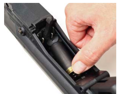
Figure C-2: Loading a Shell into the Magazine Tube