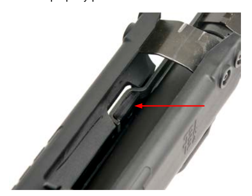
Figure E-1: Ensure Bolt Carrier is Locked into Forend

1. Ensure the bolt carrier is properly placed into the forend as shown in Figure E-1.