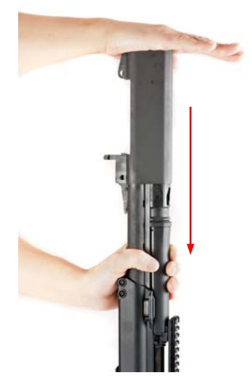
Figure E-2: Join Barrel Assembly to Receiver Assembly

Orient the barrel and receiver assemblies as shown in Figure E-2 and push the two units together, ensuring the magazine bolt screw threads seat into the magazine plug screw threads.