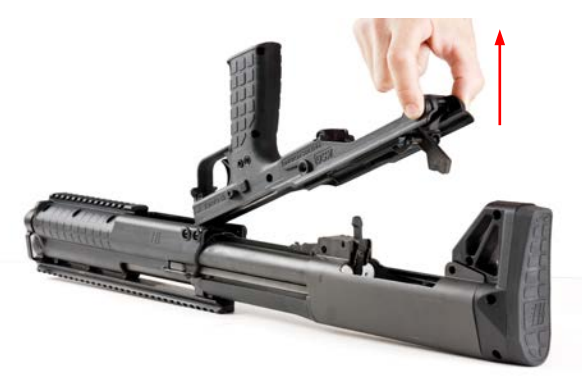
Figure D-3: Lift Grip Assembly Directly Upwards