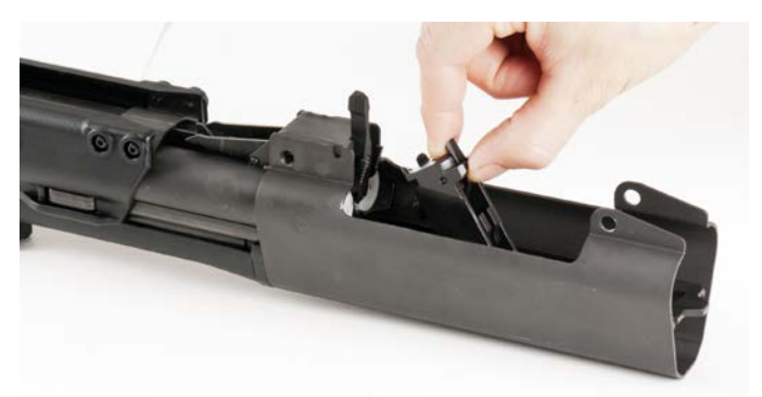
Figure D-5: Remove Bolt from Receiver

Move the forend to its rearmost position to gain access to the bolt. The bolt should now be resting in the receiver of the KSG<sup>™</sup> and can be easily removed by reaching in and lifting out the bolt as shown in Figure D-5 .