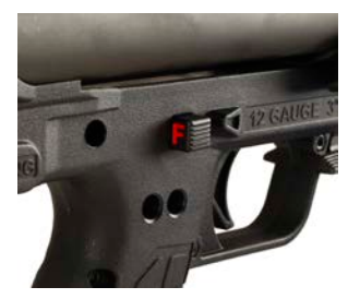
Red "F" for FIRE