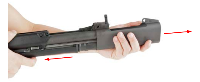
Figure D-9: Pull Barrel Assembly Apart from Receiver Assembly

With the KSG<sup>™</sup> upside-down, simultaneously pull the barrel assembly and receiver assembly linearly apart as shown in Figure D-9 .