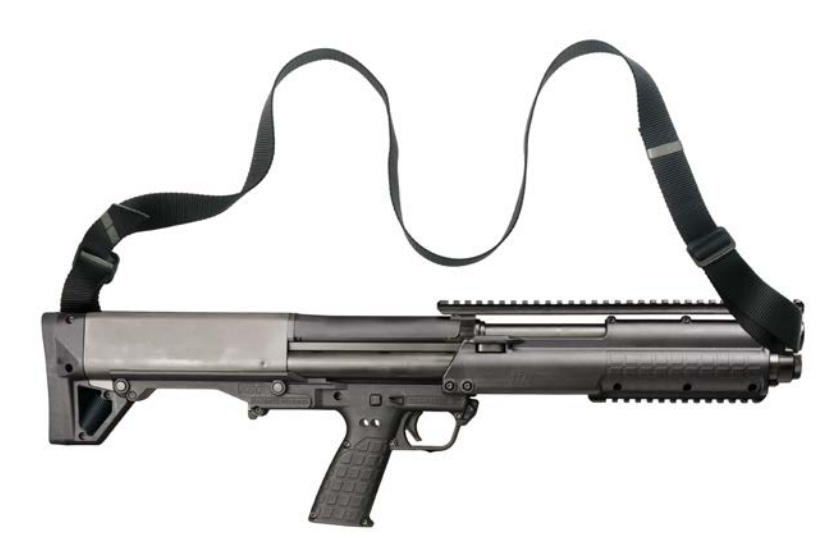
Figure B-2: KSG<sup>™</sup> Equipped with Kel-Tec<sup>™</sup> Sling

The KSG<sup>™</sup> comes equipped with forward attachment points on the left and right sides of the barrel assembly as well as a single rear attachment slot in the stock.