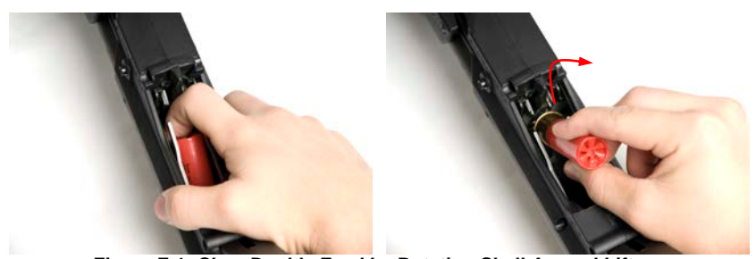
Figure F-1: Clear Double Feed by Rotating Shell Around Lifters

Otherwise, you must manually reach into the ejection port and remove the interfering shell by rotating it around the lifters as shown below.