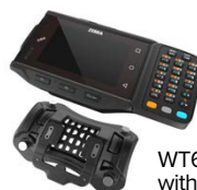
WT6000 with accessories