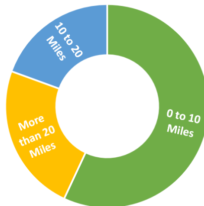
Covanta Essex Workforce Proximity to Facility

Covanta is committed to being an active and supportive community member. We have a responsibility to give back by investing in Newark, providing jobs for residents and supporting educational, environmental, social and economic developmental opportunities as appropriate. Nearly a quarter of Covanta Essex employees live within five miles of the facility – more than half live within ten miles (see chart below).