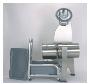
FOOD CART SHOWN WITH VCM