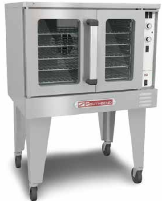
(ES/10SC shown with optional casters)