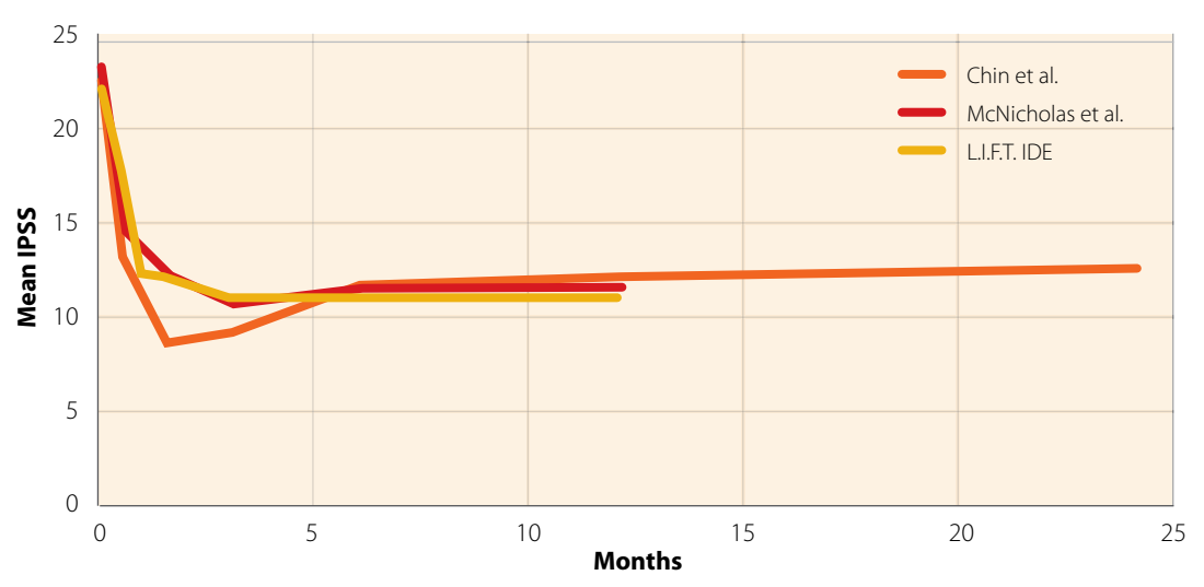
Chin et al.: Urology 2012; McNicholas et al.: European Urology 2013; Roehrborn et al.: Journal of Urology 2013

206-patient L.I.F.T. IDE Study, a multi-center, randomized, blinded study. All primary and secondary endpoints were met. Patients experienced rapid symptomatic improvement, increased urinary flow rates, preserved sexual function and a significant improvement in Quality of Life.