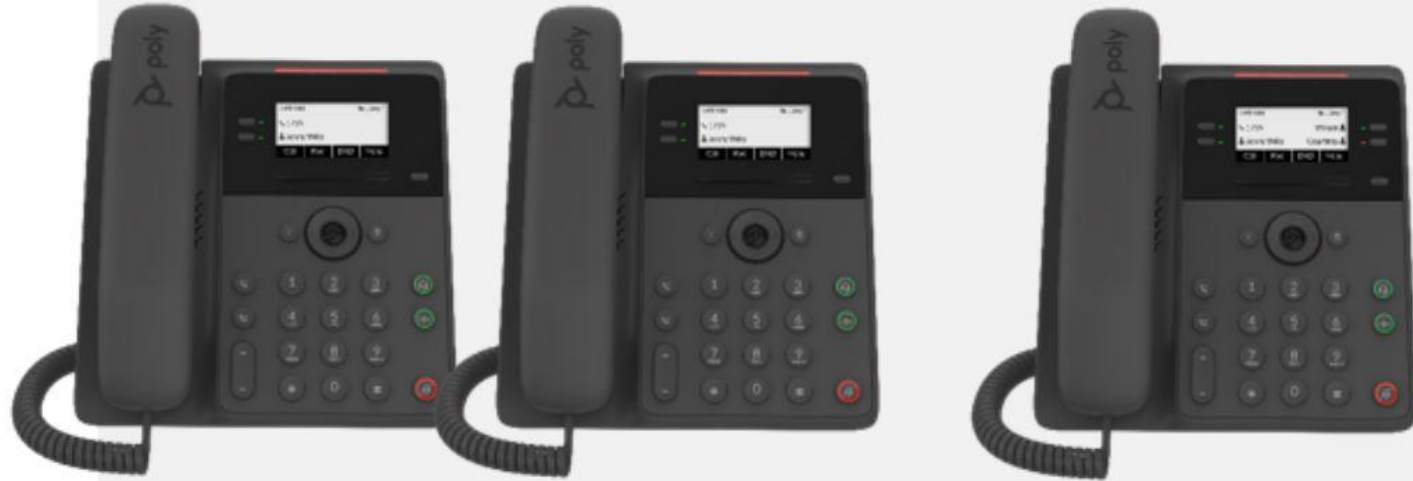
Poly Edge B10