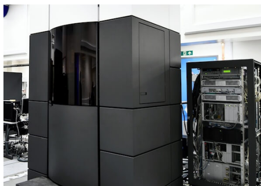
Electron microscopes at eBIC

Scientific institutes have geared up to meet the needs of the emerging cryo-EM community. Close to Evotec’s UK site at Abingdon, a dedicated electron bio-imaging center ( eBIC ) has been set up at Diamond, the UK’s national synchrotron science facility. It includes five of the latest-technology cryo-EM instruments and has one set aside for industry use only.