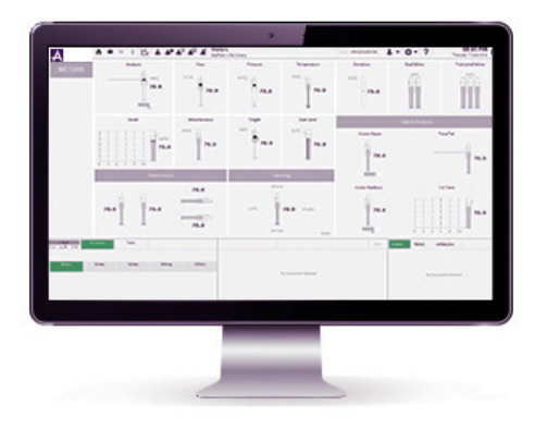
Library of Configurable Objects