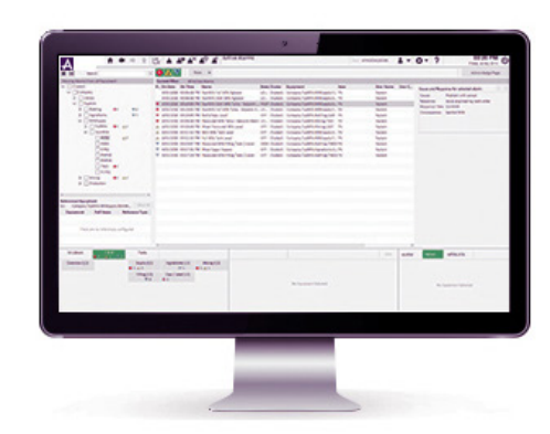
Alarm Management Enhancements