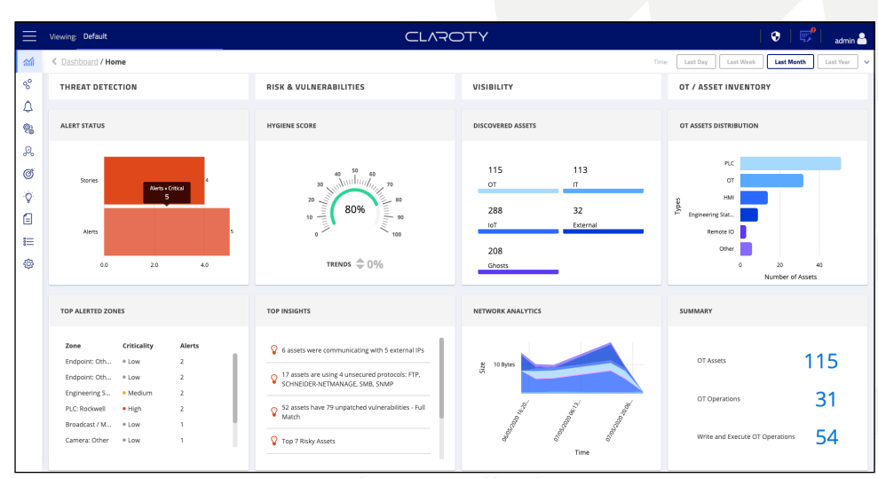
Claroty CTD Dashboard