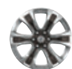
20-inch aluminum Standard on Laramie Longhorn with lower two-tone paint (WRC)