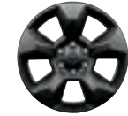
20-inch Black aluminum Available on Sport (WRV)