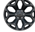
22-inch Black-painted aluminum Included with Black Appearance Package on Limited (WPS)