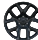
22-inch Black-painted aluminum Included with Night Edition on Laramie (WPH)