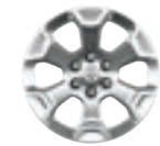
20-inch chrome-clad aluminum Available on Big Horn (WRK)