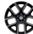
22-inch polished aluminum Available on Laramie with Sport Appearance Package and Sport; Included on Laramie with Black Appearance Package (WPM)