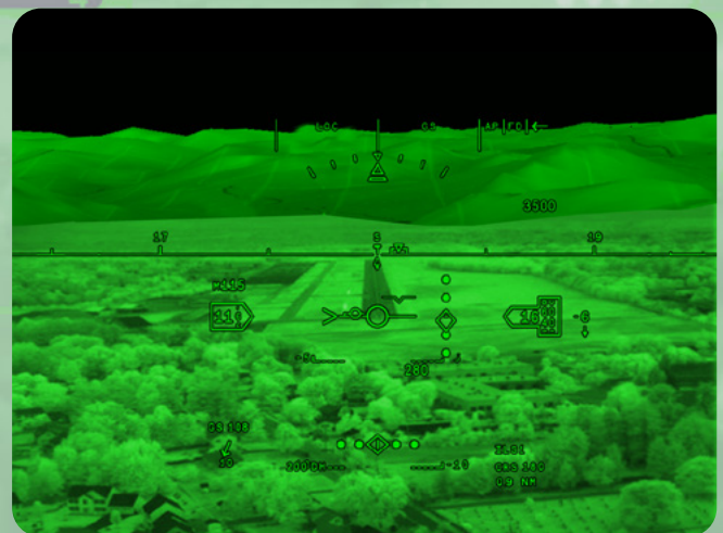
Combined EVS and SVS