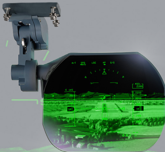
Overhead-Mounted Digital HUD