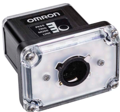
MicroHAWK V430 with ring light capable of capturing codes in all sorts of applications – including metal cavities – it is the scanner of choice for industrial traceability solutions.

In addition, the latest technologies are built to last longer than before, and longevity is essential when these products are built into complex sample analyzers. Omron focuses on maximizing product longevity as well as managing obsolescence with effective transition plans for OEM customers, thereby making overall clinical diagnostics solutions much more dependable.