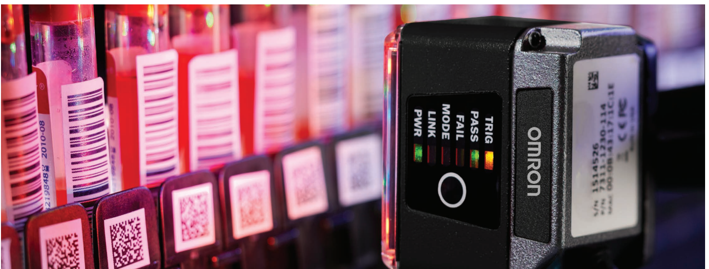
A MicroHAWK reads data from codes placed on test tubes.

Health Canada has similar regulations to the FDA UDI and GS1-Canada assists Medical Device Manufacturers with issuing UDIs which are used both in Canada and the US. GS1 has a Global Trade Identification Number (GTIN) which is a globally unique ID number which would allow a company to sell a product both in Canada and the US and keep the UDI information in both the FDA and the Health Canada databases.