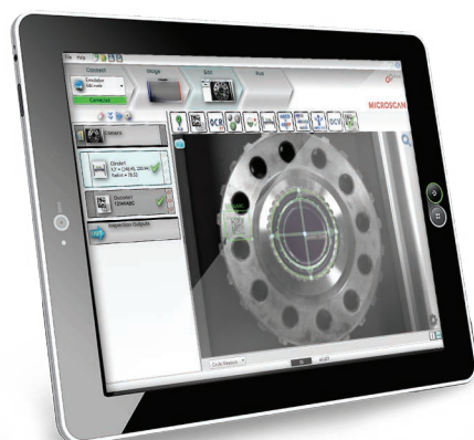
Omron MicroHAWK with weblink software for precision traceability and inspection solutions.

addressing specific challenges with advanced barcode reading, machine vision and DPM verification systems. Miniaturization, product longevity and ease of use are major themes in the design of new solutions for traceability in the medical industry.