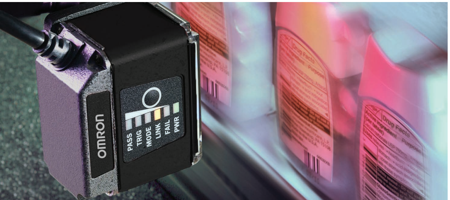
MicroHAWK industrial barcode readers are an integral part of Omron's overarching traceability solutions.

The MicroHAWK line is also incredibly easy to use. With the browser-based WebLink interface, these barcode readers read right out of the box with no software installation whatsoever. This "out-of-box experience" is a hallmark of an Omron solution, as Omron has even managed to make machine vision technologies such as its HAWK MV-4000 smart camera intuitive to the average user as well as to the expert.