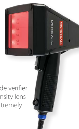
Omron's LVS-9585 handheld barcode verifier is equipped with a special high-density lens that can comprehensively verify extremely small codes and DPMs.