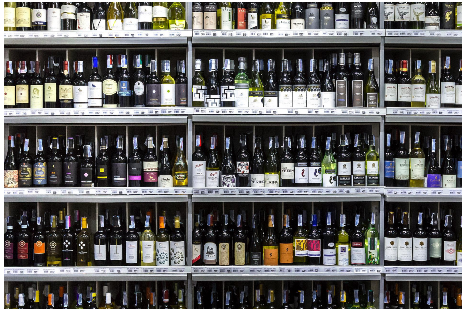
Wall of Wines