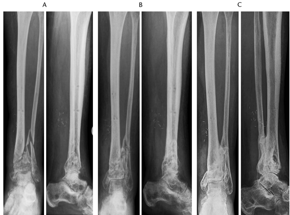
FIGURE 2. A 54-year-old diabetic woman with atrophic nonunion after a fall. Treated with one session of extracorporeal shock wave therapy and casting for 8 weeks. (A) Anterior–posterior (AP) and lateral views at 6 months. (B) AP and lateral views 3 months after treatment. (C) AP and lateral views 6 months after treatment.

were significantly associated with complete bone healing (Table 2). The significantly lower likelihood of fracture healing in patients requiring multiple (more than one) shock wave treatments versus a single treatment may be attributable to the