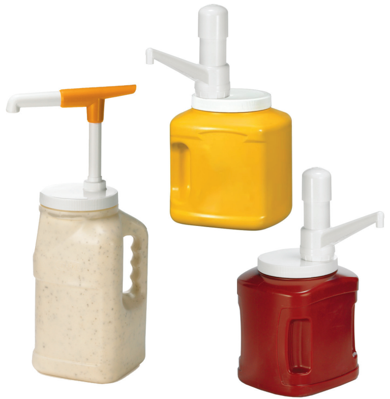
#1128J: 128 oz HDPE Jug