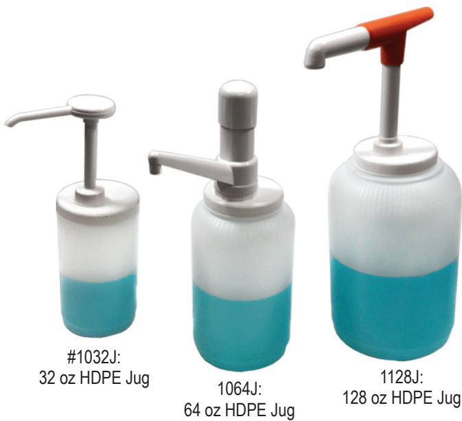
#1032J: 32 oz HDPE Jug