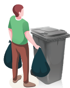
Black bin Wet waste