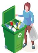
Green bin Recyclables

Place your recycle bin outside your property on the sidewalk for our team to collect on the day following your normal collection.