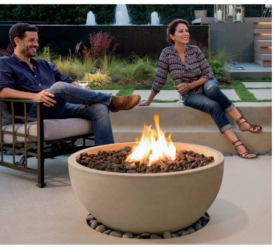
Infinite Fire Bowl in Oyster Shell with a Honed Finish

Distinguished by craftsmanship, accentuated by firelight and designed to gather round, Kindred Outdoors & Surrounds creates memorable spaces that bring people together through thoughtful composition and functionality. With hand-forged fire bowls, fireplace surrounds and outdoor kitchens, friends and family can commune, converse, and unwind in comfort both inside and outside of the home.