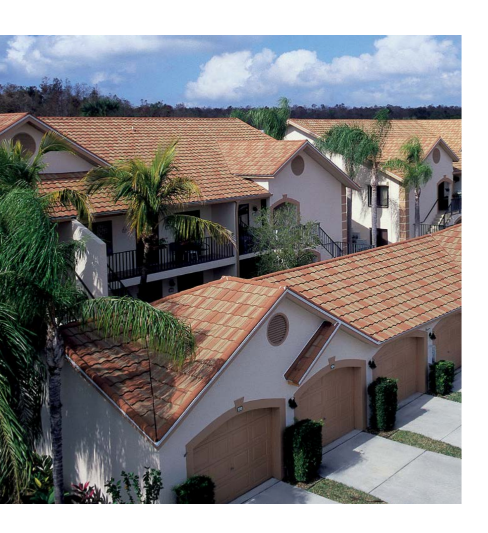
www. We stlake Royal Roofing. com

Westlake Royal Roofing is a recognized, national leader in durable and sustainable clay, concrete, and steel roof systems and components. Our products deliver the critical features and benefits that will help insure your project has a beautiful, durable, energy-efficient roof.