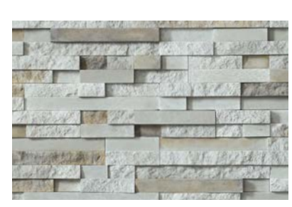
Pro-Fit® Terrain™ Ledgestone