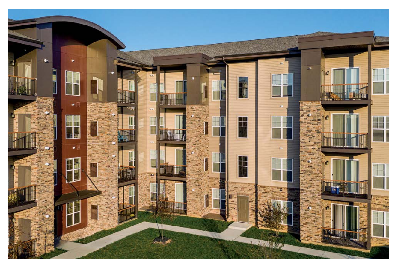
StoneCraft Ledgestone in Chardonnay & Tennessee

Our commitment to craftsmanship can be seen within every textural detail, countless hours spent hand-chiseling each and every natural stone before it was carefully replicated through our proprietary mold techniques. At StoneCraft we honor the masonry traditions of the past and promise to deliver quality and affordability with every stone we make.