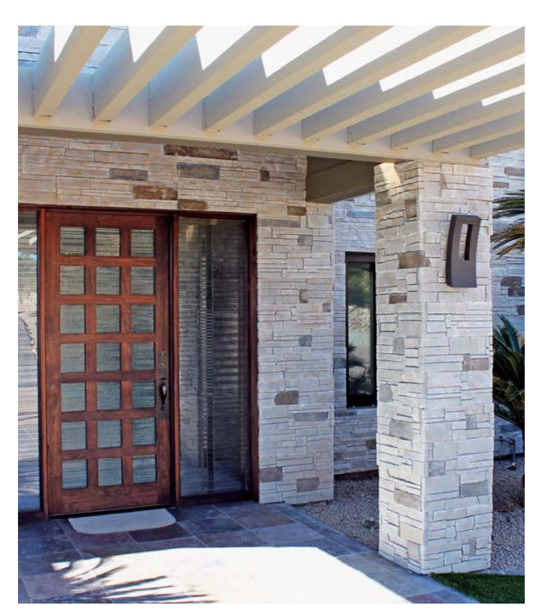
Versetta Stone Ledgestone Style in Mission Point