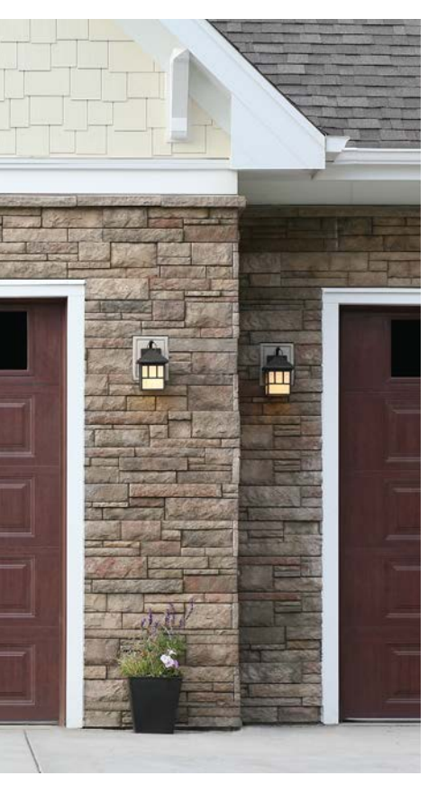
Versetta Stone Tight Cut Style in Terra Rosa