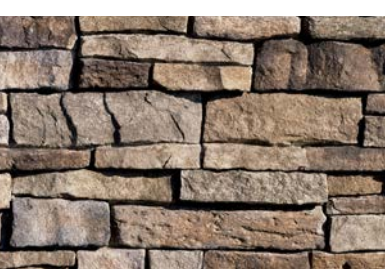
Mountain Ledge Panels