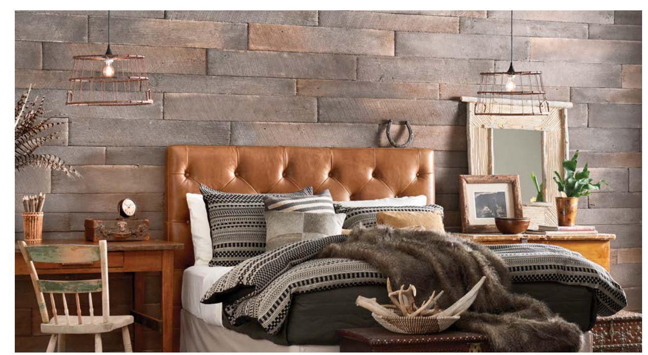
Dutch Quality Stone Weathered Plank 4 & 6 in Winesburg

Otherwise, it just wouldn't be Dutch Quality Stone.