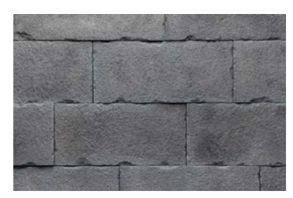
Carved Block Style