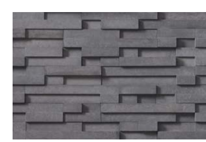
Pro-Fit® Modera Ledgestone