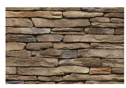
Lauren Cavern Ledge