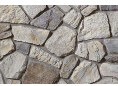
Old Country Fieldstone