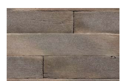
Weathered Plank 6