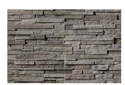
Pro-Fit® Alpine Ledgestone