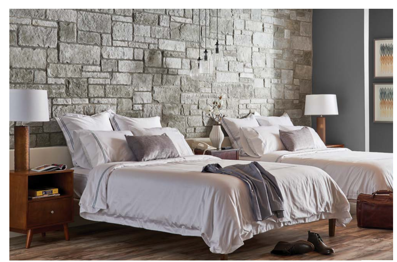
Cultured Stone Sculpted Ashlar in Silver Shore®

As pioneers of the manufactured stone veneer category, the master craftsmen of Cultured Stone have embraced excellence and artistry for more than half a century. Our premium products have inspired architects, contractors and designers across the country to design some of today's most innovative structures. As one of the most tested stone products in the industry, we strive to offer the highest quality materials through stringent control measures and rigorous standards for durability, reliability and consistency.