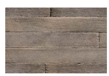
Weathered Plank 4