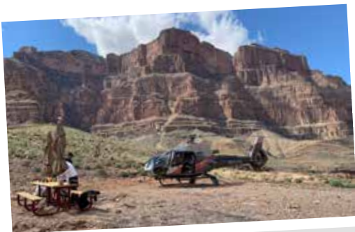
Definitely not a landfill. The base of the Grand Canyon is one the most spectacular places to visit if you get the chance