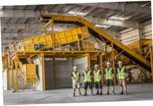
Our installation team have continued to travel despite the challenges presented this year. Here they are in Dubai close to the end of another multi-million-pound install for Kiverco