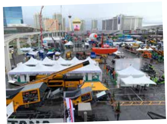
The last exhibition to be held in 2020 was the Conexpo in Las Vegas at the beginning of March. Kiverco was in attendance and met several key businesses to discuss large waste processing projects