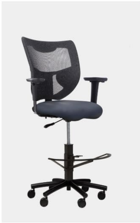
The Tank Low Back Swivel

Customization can even include your organization's logo.