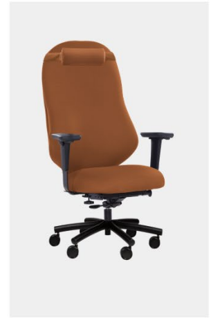
Rocky Low, Medium or High Back