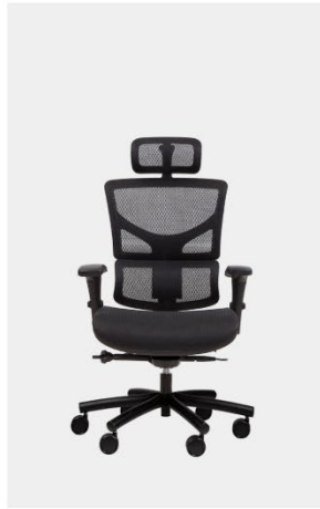
Marcella High Back Multi-Function