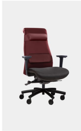
Felix Up to 600 Pound Capacity