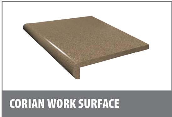
CORIAN WORK SURFACE

The sample Colors, Stains, Grains, and Finishes shown may vary slightly from actual product samples. If necessary, please request an actual product sample.