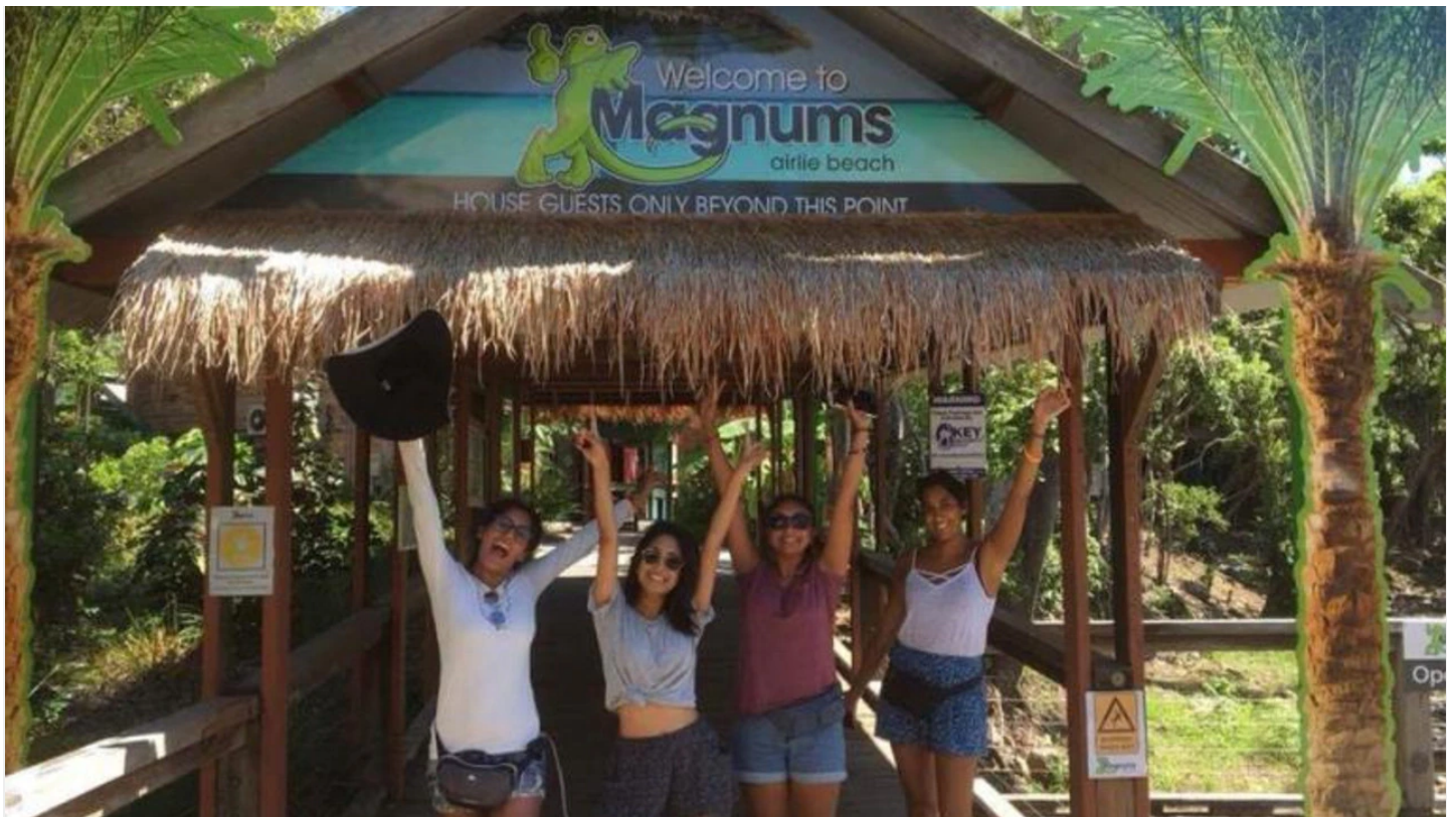
Magnums Backpackers and Nightclub Airlie Beach is a magnet for partying backpackers

QLD's first homebuyer hot spots for federal assistance