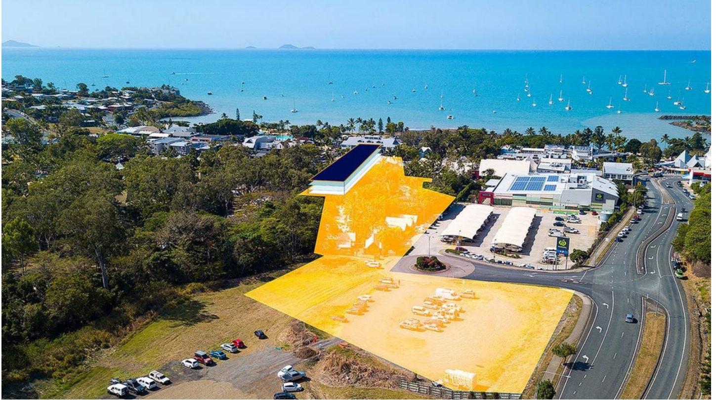
The site for sale

“This is the first time in approximately 37 years that the main operating properties have been offered for sale in one line.”