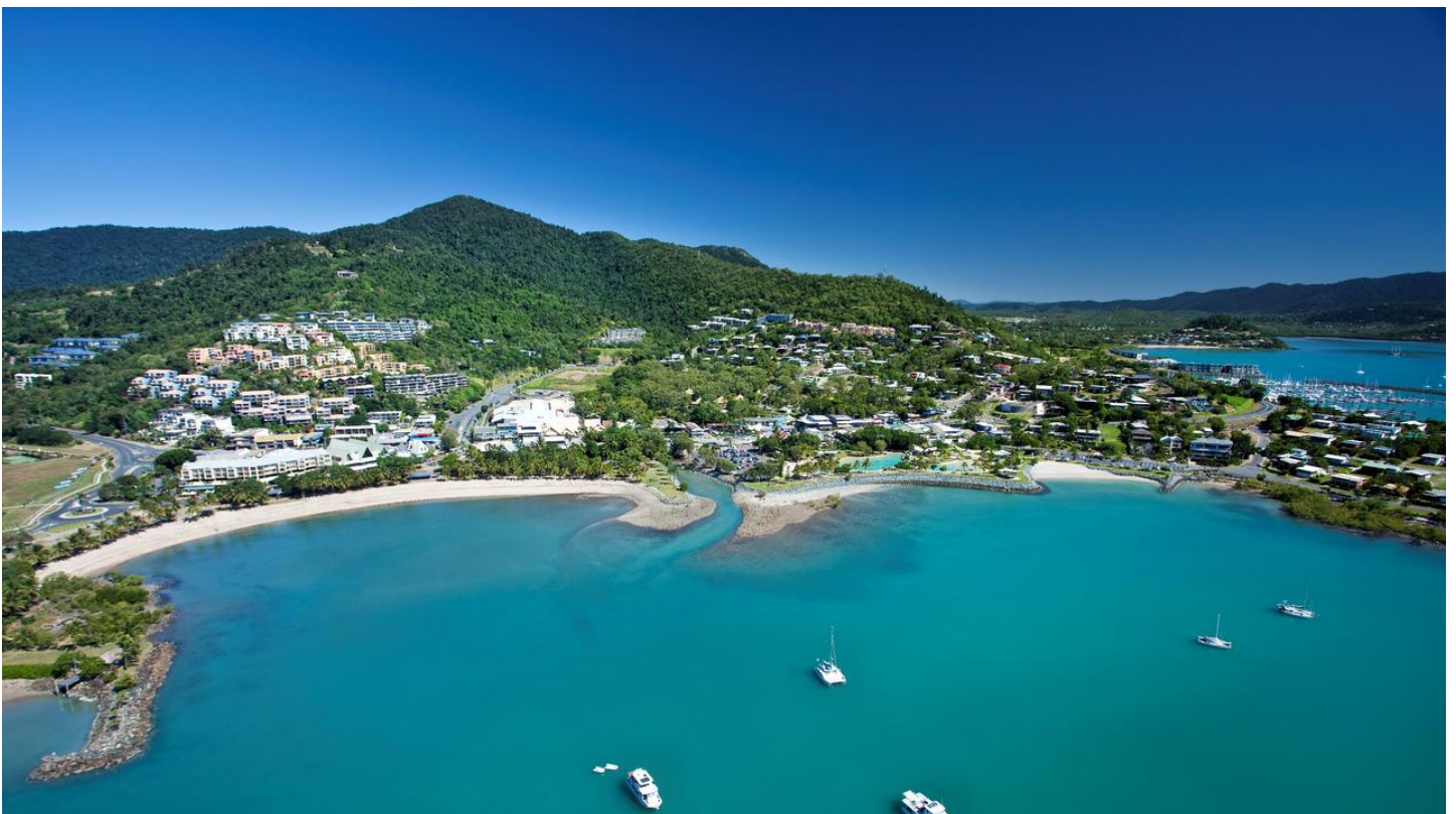
Aerial view of Airlie Beach

Watch brand new Vanderpump Rules on BINGE 14 day free trial for new customers