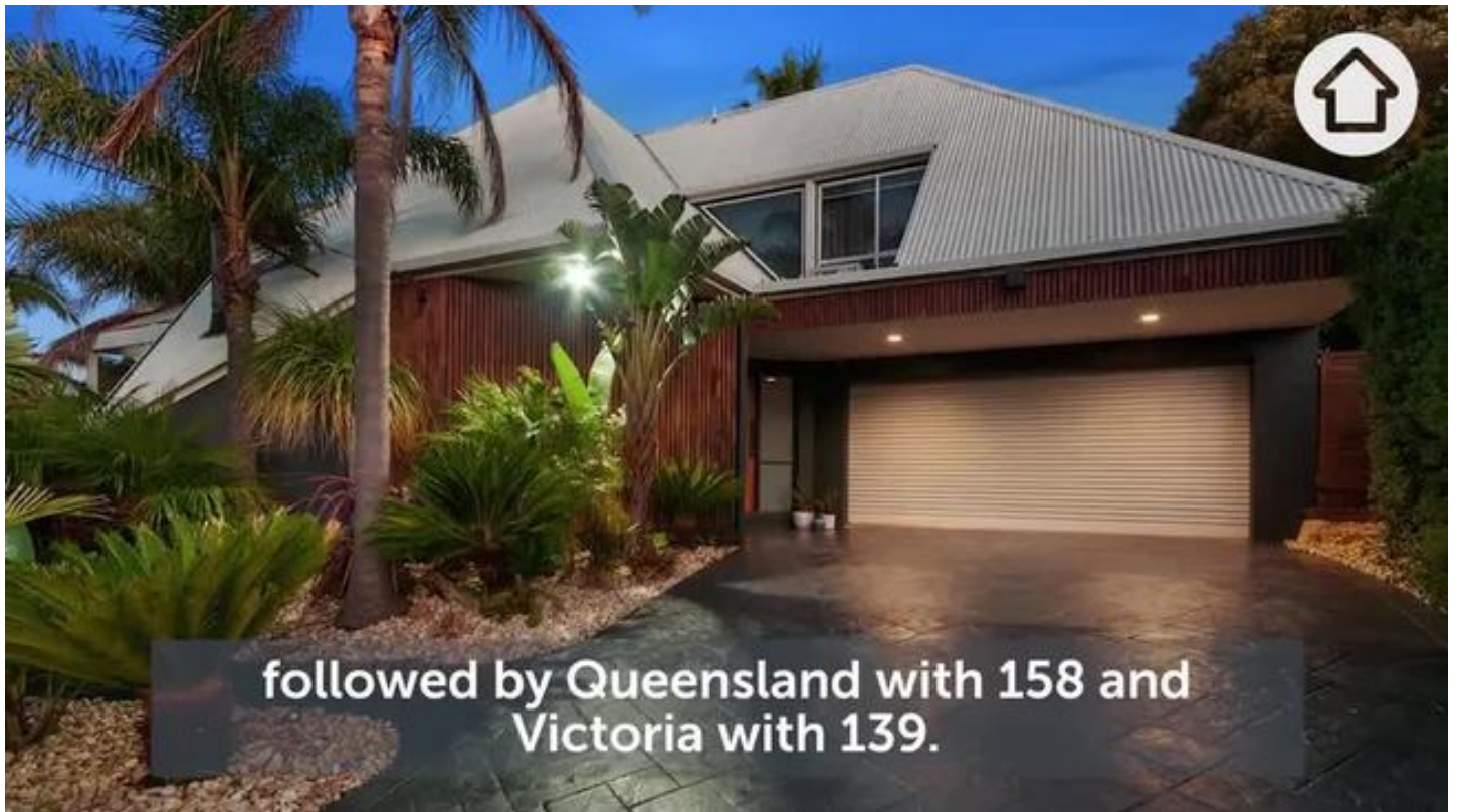
Australia's record breaking suburbs of 2021