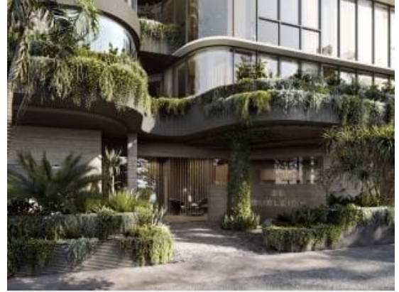
Artist impression of 88 Burleigh by Allure Property Corporation