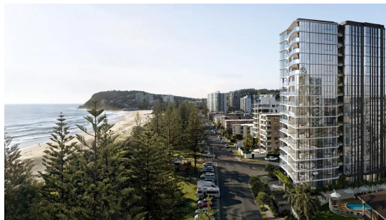
Artist impression of 88 Burleigh , a 17-level tower in Burleigh.