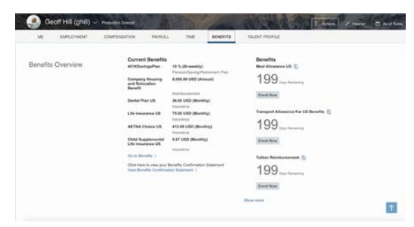
Figure 4: Global Benefits

employee eligibility criteria, and postenrollment workflows. Our global benefits functionality makes it simpler for employees to access, edit, and learn about their benefits, including reimbursements and allowances, pensions, and insurance plans. The key is to make these processes intuitive, so employees can accomplish their tasks and move on.