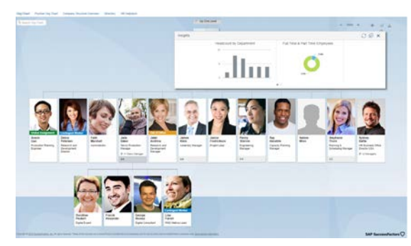
Figure 1: Core HR

business processes more seamlessly across the HR domain for improved insight, strategic decision-making, and, ultimately, better business performance.