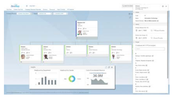
Figure 6: Embedded Insights and Dashboards

SAP SuccessFactors Employee Central gives you visibility into your entire workforce. It provides a holistic insight that supports better decision-making for both HR and management based on data-driven insights and helps you keep your finger on the organization's pulse. Embedded role-based reporting and graphical dashboards give you a one-click, bird's-eye view of context-sensitive insights – without requiring you to navigate away from whatever activity you're working on.