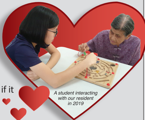
A student interacting with our resident in 2019