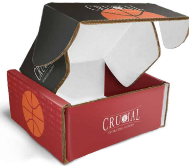
No. 87006 4" x 4" x 2"