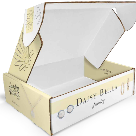
No. 87045 10" x 8" x 3"

See Appendix A for complete information.