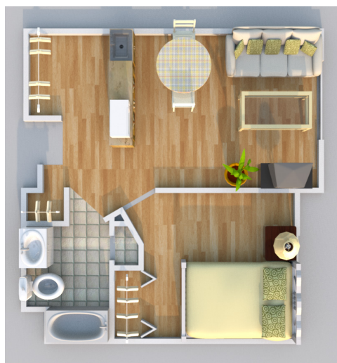
1 Bedroom & 1 Bedroom Den 550+ sq. ft.