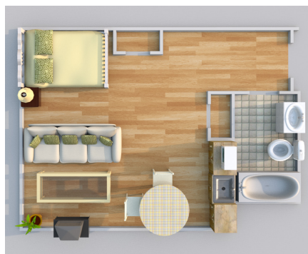
Studio 367 sq. ft.

Choose from our spacious studio, 1 bedroom or 1 bedroom plus den floor plans.