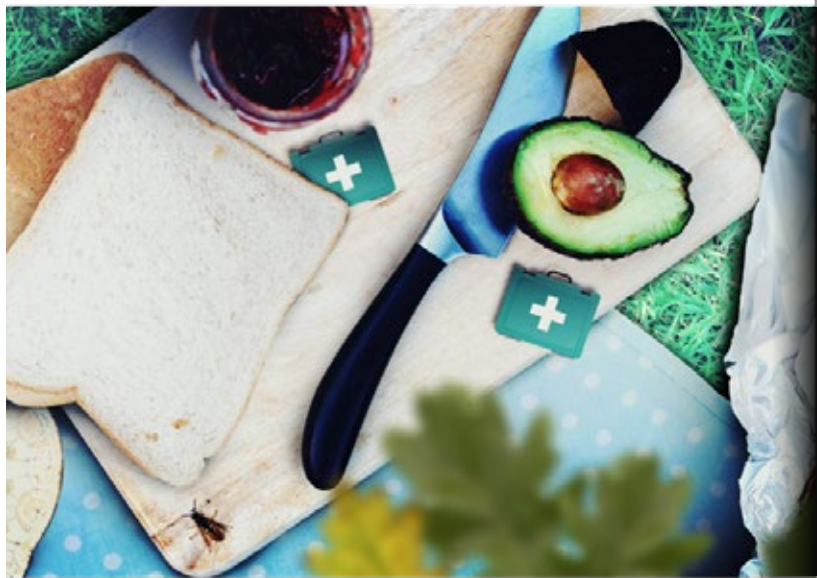
Parallax Scroll View