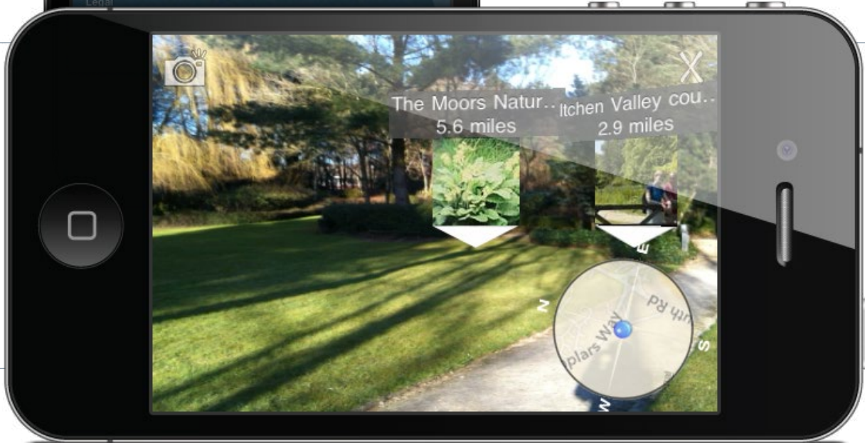
Map & Augmented Reality Screens

Great British Picnics has been well received by users and critics alike – here are just some of the things reviewers have said about the app: