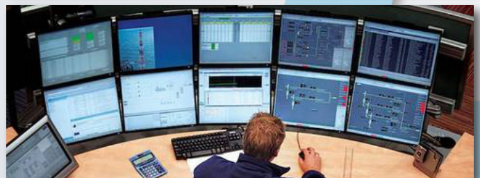
Performance during Day and Night

The oil and gas control room has about 30 employees with a 5 week rotating shift. Over a period of twelve weeks, an iPad was set to the AlertMeter website in the control room, and alarms were set on the iPad to go off at different times of the day and night. When the alarm sounded, an employee would walk over and unplug the iPad, take the 60-second test, and hand it to the next Operator. When the last Operator had taken the test, they would take the iPad back to its spot in the room and plug it back in.