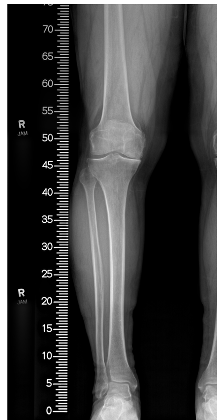
Figure 3. Samsung GC85A fast stitching function enhances image quality and customer satisfaction level by reducing the number of retake exams.