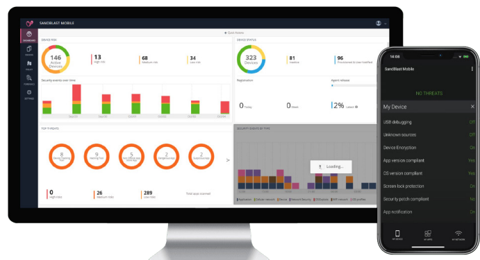
Harmony Mobile Management Console