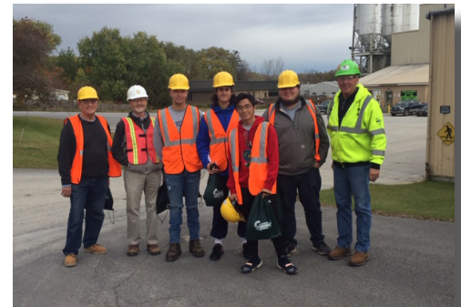
SUNY Poly students tour Clemente Fane Concrete in Oriskany