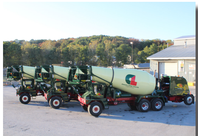
Three of our brand new mixers in our original Clemente Latham Concrete colors