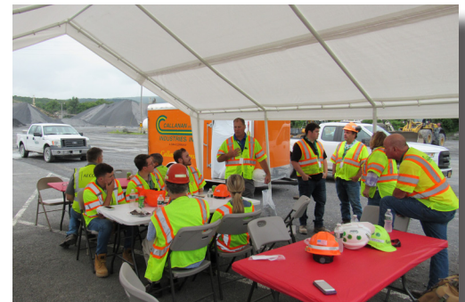
AECOM Engineers visit our South Bethlehem Quarry