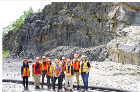
Geology students from Queens College touring our East Kingston Quarry