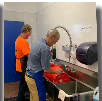
Tuesday, October 22 Community Garden Maintenance for Capital Roots