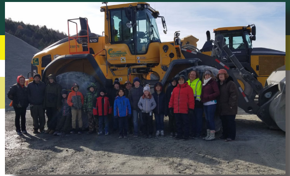
Cub Scouts and Boy Scouts visit our Bridgeville Plant

Callanan has been opening its doors to students, industry partners, and community members for decades. Giving these groups the opportunity to gain insight on our industry has proven to be invaluable to everyone involved. Not only do tours of our operations give people a better understanding of what we do, but it also allows our own employees to share the work that they are so proud of. We have been happy to host Cub Scouts, students of all ages, engineers and more at many of locations this year. If you are interested in setting up an educational tour of one of our facilities, feel free to reach out to us anytime!