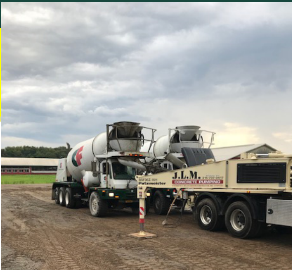
CFC pouring a portion of a 900 yd bunk silo for long-time customer, Ken Miller of JLM Concrete Pumping