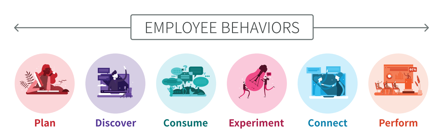
Figure 2: RedThread Employee Development Framework

A few years ago, we introduced the RedThread Employee Development Framework, shown in Figure 2. This framework describes the behaviors orgs should be enabling in their employees in order to have a solid learning culture. We use this framework to make sense of the world of employee development and to help leaders identify any gaps they should be paying attention to.