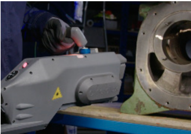
Second ergonomical handle