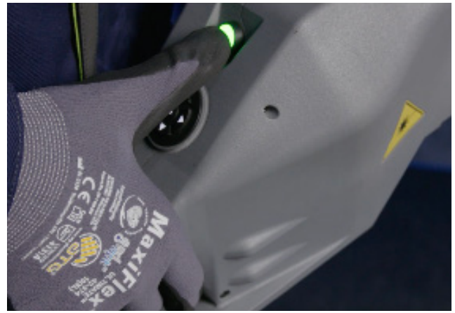
Integrated controls in handset