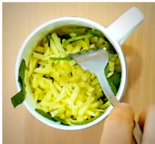
5. Add Cheese