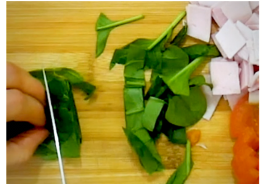
3. Chop Spinach