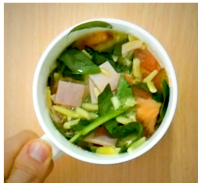
6. Microwave 2 min