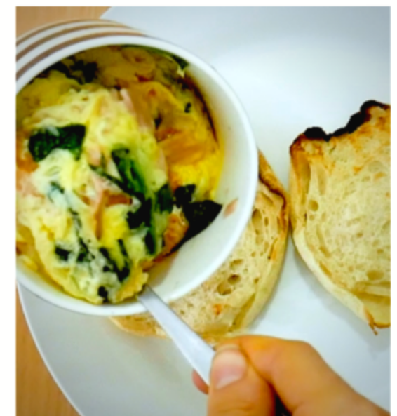
7. Bon Appétit