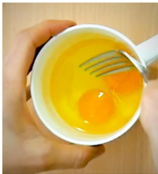
4. Beat Eggs