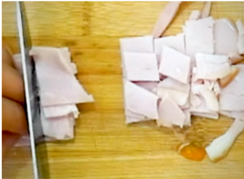
2. Dice Ham