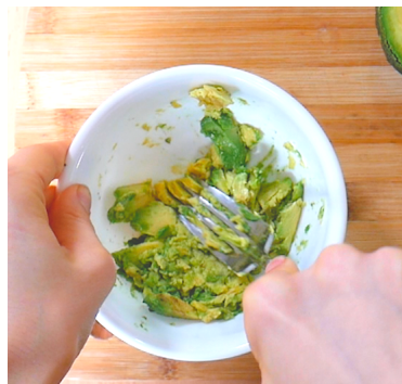
Mash 1/2 ripe avocado