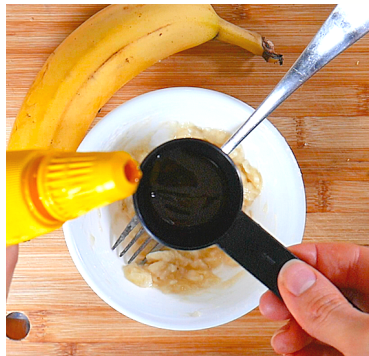
Add 1 tbsp of honey