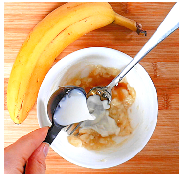
Add 1 tbsp of milk