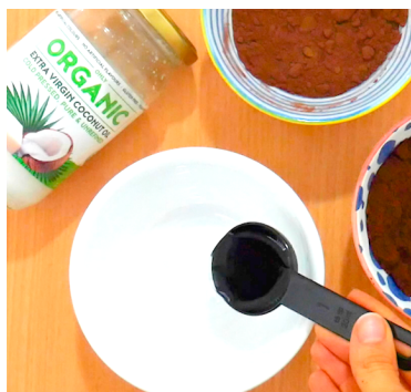
Add 1 tbsp of coconut oil