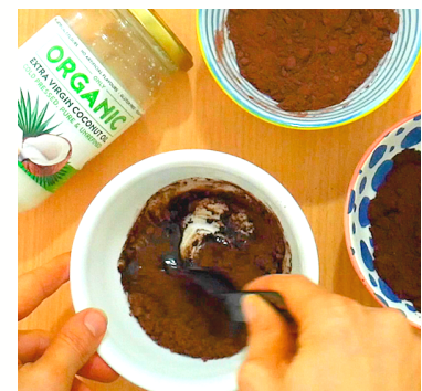
Mix until smooth