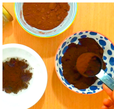
2 tbsp of coffee grind