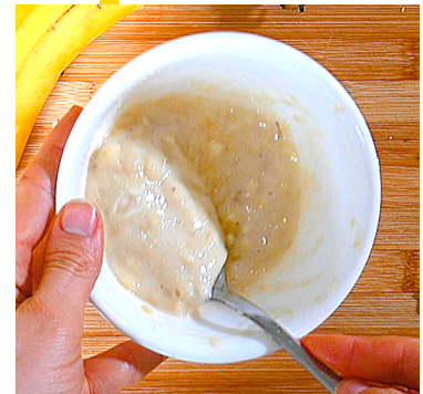
Mix until smooth