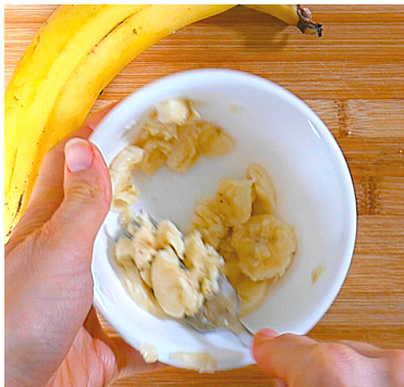
Mash 1 ripe banana