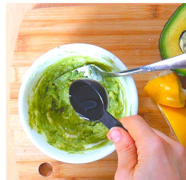
Add 1 tbsp of olive oil