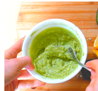
Mix until smooth