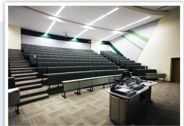
Fully integrated lecture hall; including lighting, audio visual, controls, and integrated podium