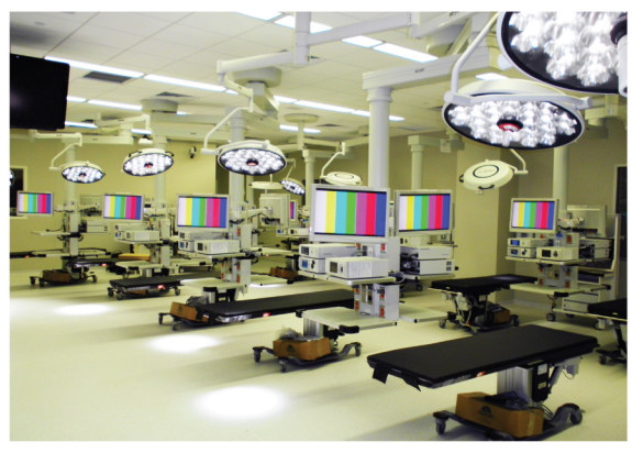
University of South Florida state-of-the-art skills lab

KR WOLFE Inc. is a service based company specializing in proprietary systems and capital equipment installation and integration. Our team of international Systems Integration/Installation Specialists are experienced, certified and licensed professionals. K.R. Wolfe Inc. delivers outstanding results building long term relationships with our clients. Our formula includes understanding client needs, dedication to every project, and adapting to a constantly changing industry. We provide exceptional service, perform quality work, and maintain a professional and enthusiastic demeanor.