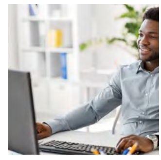
VISIT OUR NEW WEBSITE