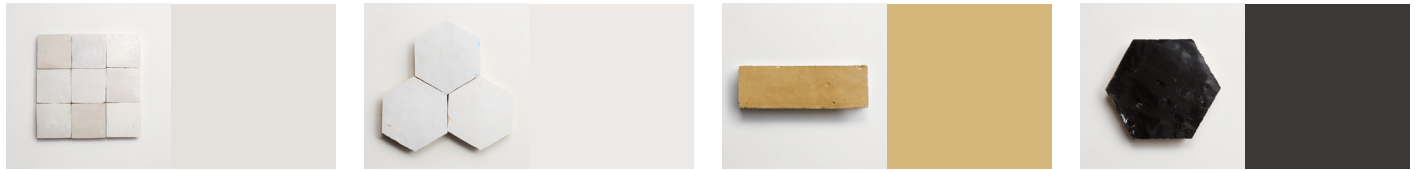
weathered white strong white 2001 sea salt wever 273 riverbed sudbury yellow 51 scribes ink pitch black 256