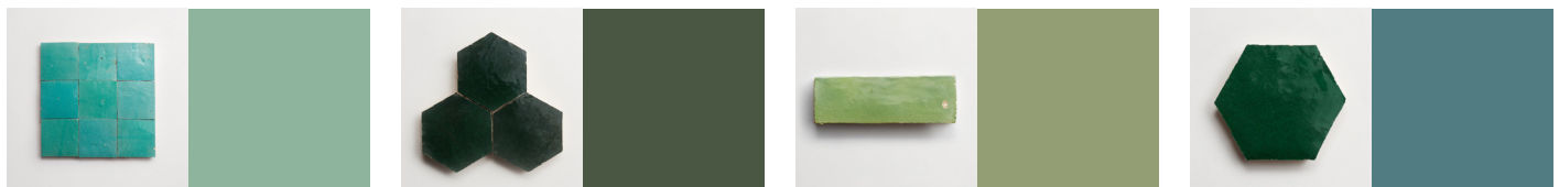
forgotten turquoise arsenic 214 cindered olive duck green 55 fallen citrus yeabridge green 287 secret lagoon vardo 288