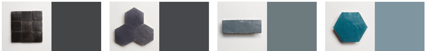
charred cedar off black 57 battled armor railings 31 tempered steel de nimes 299 fired opal stone blue 86