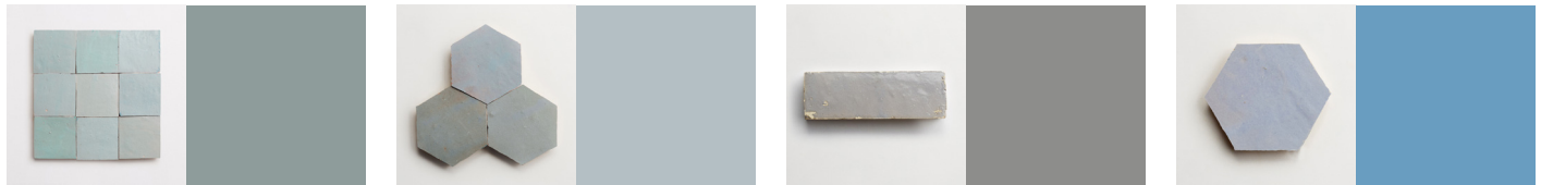
tea ceremony oval room blue 85 shattered pearl parma gray 27 tarnished silver plummet 272 sky bloom st giles blue 280