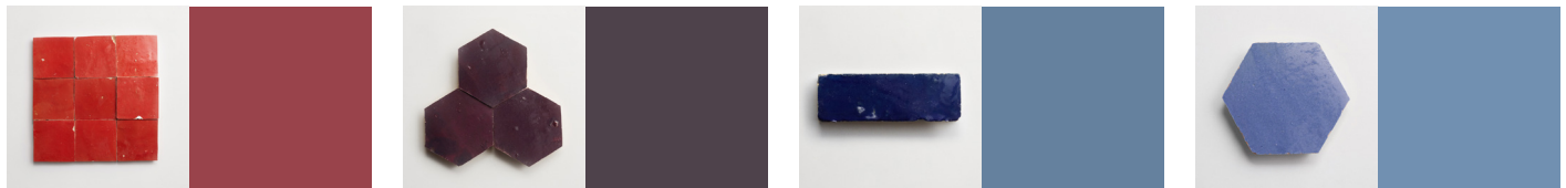
palace red rectory red 217 midnight port pelt 254 ancient sea ultra marine blue 29 cerulean cook's blue 237