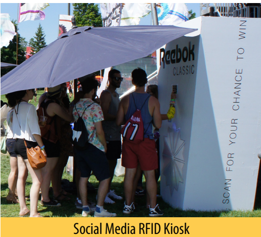
Social Media RFID Kiosk