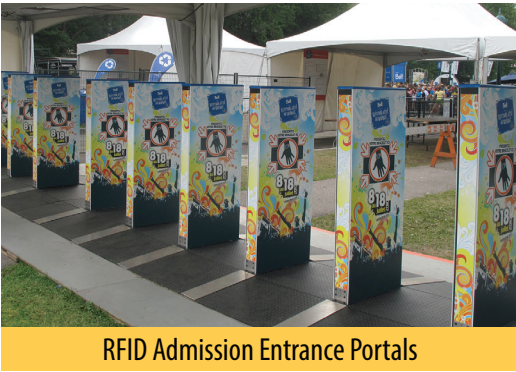
RFID Admission Entrance Portals