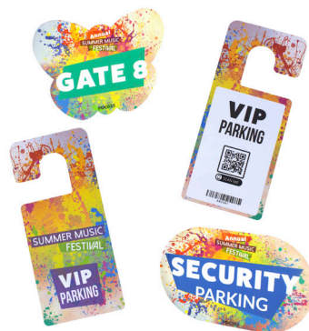
PDC Smart® Windshield Decals & Hang Tags

The design of your camping and parking decals can complement your wristband artwork and festival theme. Create separate designs for visual verification of parking, camping, and other access permissions.