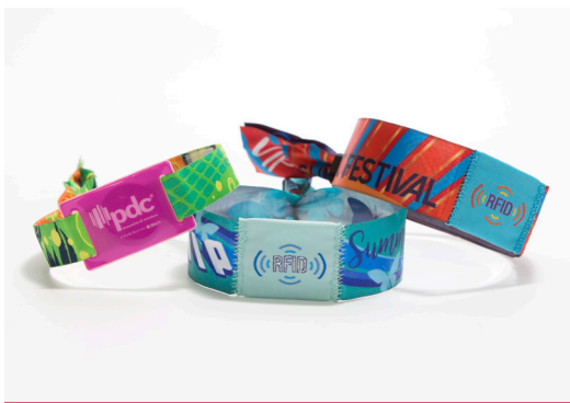
PDC Smart® Woven Wristbands