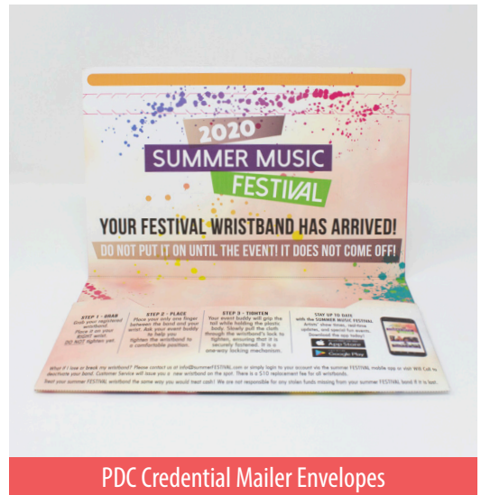
PDC Credential Mailer Envelopes

Mailing wristbands pre-event helps reduce wait times and accumulated crowds at entrance locations. The less time fans spend waiting in line, the more time they have to spend money at your festival. During the ticket sale process, your ticketing company will need to capture your fan's mailing address for fulfillment prior to your festival. Your package should include online registration information and specific instructions on what fans need to do before they arrive. Customizing a credential mailer envelope is an easy way to build fan excitement and distribute unique credentials and instructions.