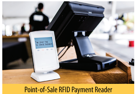
Point-of-Sale RFID Payment Reader

Cashless Point-of-Sale systems depend on how many vendors and locations will be set up for cashless payments. Your cashless provider should assess your festival to determine the equipment and internet infrastructure requirements. It's also imperative that your cashless provider provide a contingency plan for any system downtime to ensure transactions run smoothly throughout the course of your festival.