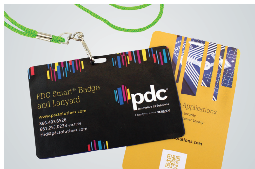
PDC Smart® Badge & Lanyard