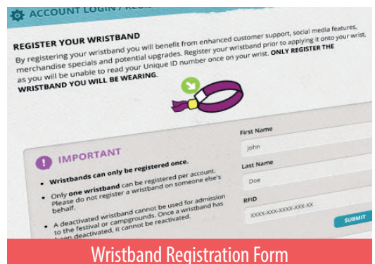
Wristband Registration Form