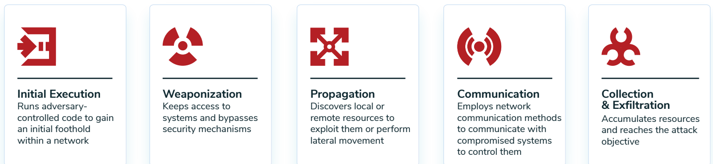
How Aqua DTA identifies stages of the attack kill chain

By using Aqua DTA, security teams can reduce the potential risk in container images before they are deployed