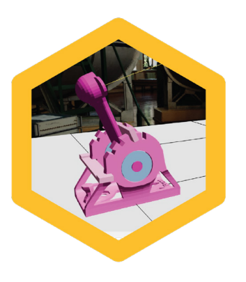
Virtual STEM Kits