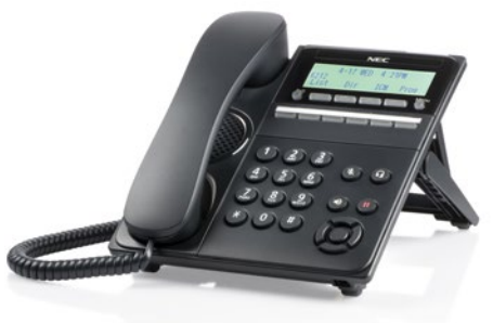
DT920S 6 button phone with greyscale display