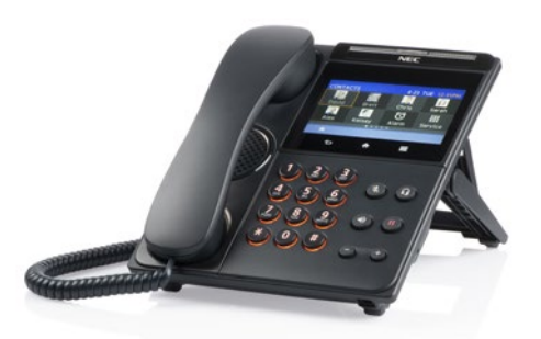
DT930S Touch panel color display

With over 120 years of experience in telephones and communications systems, NEC has paired some of our best desktop telephones with UNIVERGE BLUE.