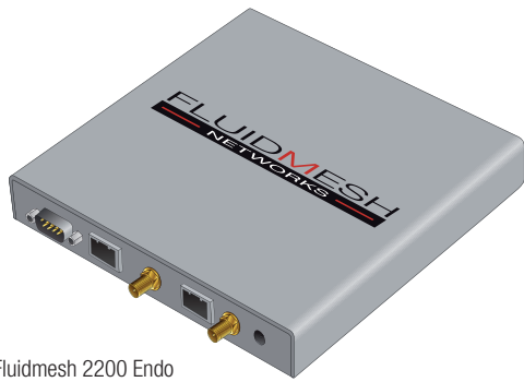
Fluidmesh 2200 Endo

The Fluidmesh Endo units include support for 128 bit AES Encryption at the link-level which can be used for FIPS-197 compliance. Because AES is implemented in hardware, there is no loss in terms of performance when AES is enabled.